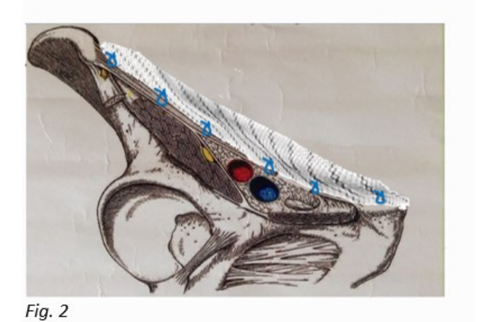
Conclusion: Mesh attached to Cooper's ligament and using bone structures for enforcement of fixation gives good results in hernia repair for recurrences when inguinal ligament is cut or damaged.